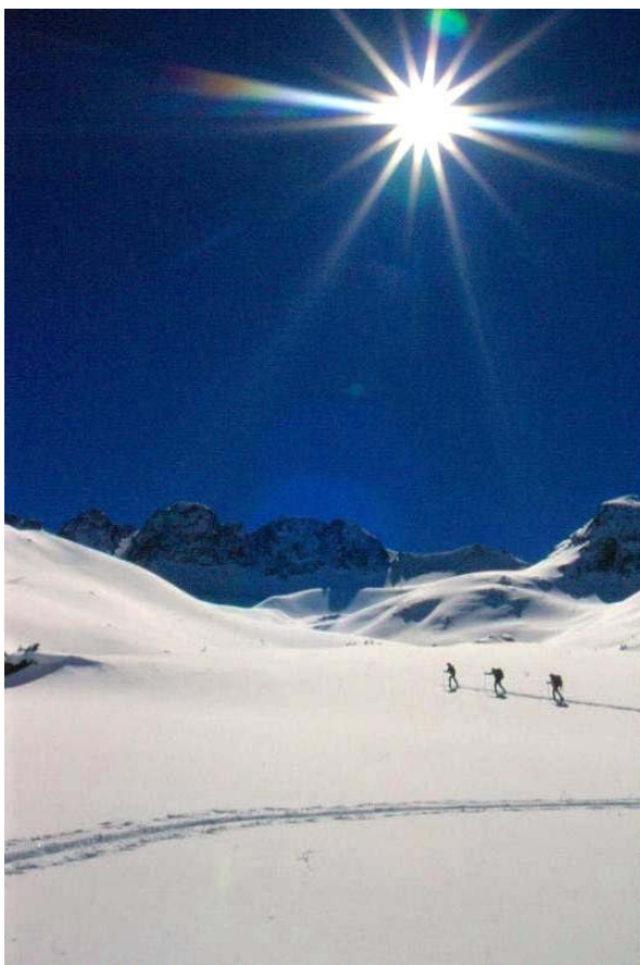
“Stillness of Winter” by Spencer Swanger

December – 2004 Salon Dinner and Photo Show.